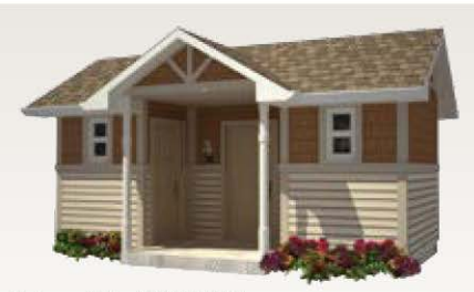
Cabana 20' x 21' 2851-501