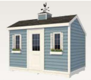
Saltbox Roof Shed 12' x 8' 2758-098