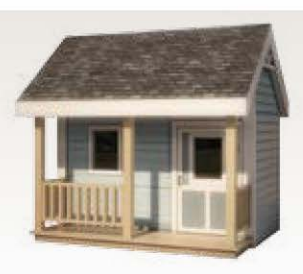
Kids Playhouse 8' x 6' 2861-505