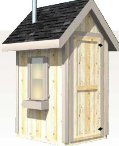
Pit Toilet Outhouse 4' x 5' 2655-971

There are dozens of projects you can do on your own while at the cottage to enhance your cottage life. They are so simple and easy that you'll want to jump right from one project to the next.