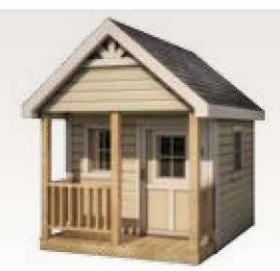
Kids Playhouse 6' x 8' 2861-503