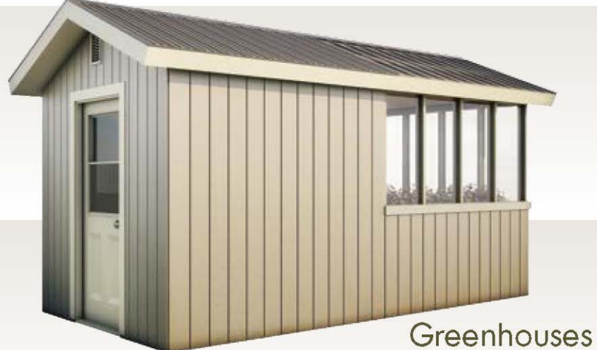
Greenhouse Shed 16' x 8' 2865-030